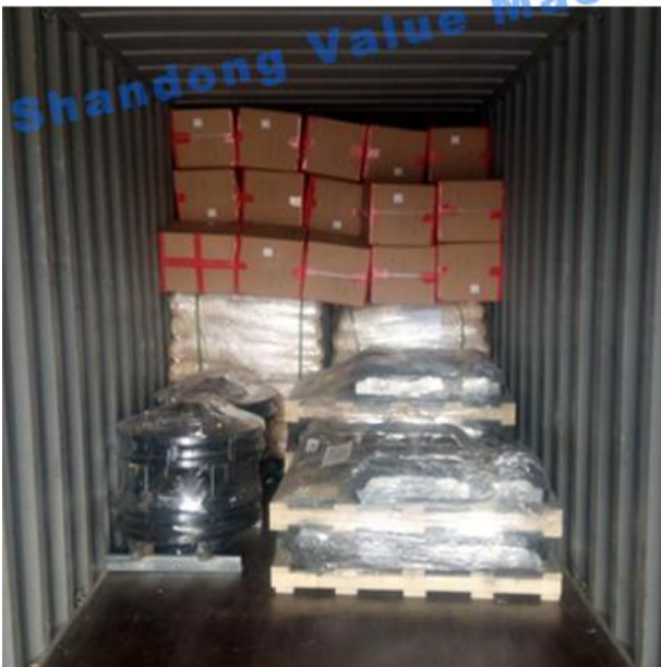
Parts in the Container