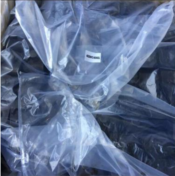
2 sets Drive Chains are packed in One Plywood Crate